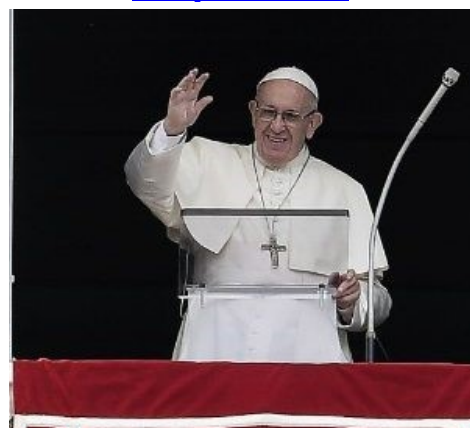
At the Angelus for the Solemnity of the Assumption of the Blessed Virgin Mary, Pope Francis focused on the truth that God wills to save the whole human person, body and soul.