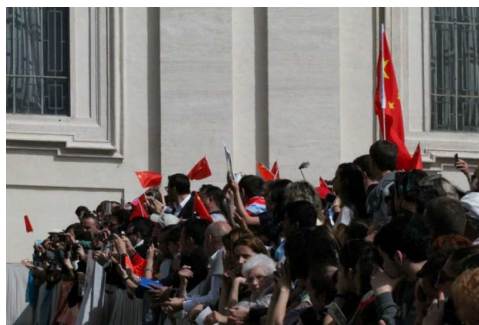
Pilgrims from China at a general audience in St. Peter's Square Kevin Jones Beijing, China, Jul 25, 2018 / 12:00 am (CNA).-

Continuing a controversial plan, Chinese bishops allied with the government have told dioceses to prepare local versions of a "Sinicization" program to bring the Catholic Church more in-line with the government's understanding of Chinese culture, society and politics.